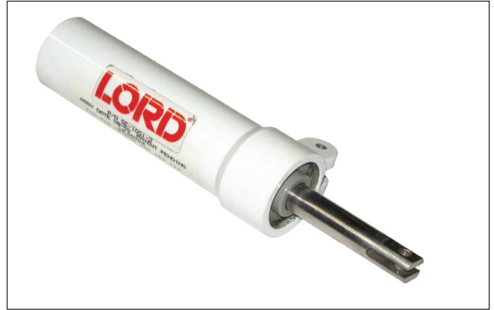
LORD Shimmy Damper

Versatile – Consistent damping from -30° to 150°F.